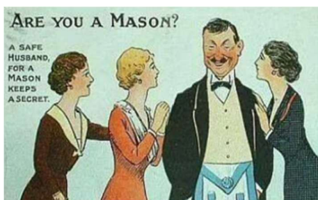
Table Lodge Team

This is your "can't miss" event!! See below for ticket information.