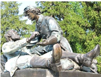
Table Lodge 2026 - Masons in the Civil War

How Much: $15 per person court cost. 6 people minimum RSVP by APRIL 20 to Bill Berklich at Berklich@aol.com or call/txt 248-404-5816 so we can get a head count for the tables. This is a public space and you're on your own for all purchases.