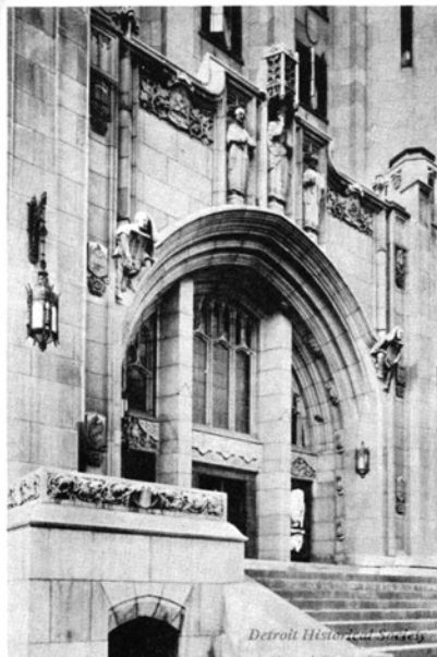
Main Entrance to Masonic Temple, Detroit.

The temple is an imposing Gothic structure at the corner of Bagg Street (later Temple Street) and Second Avenue, across from Cass Park. Within its walls are a large cathedral, several chapels, two stylish ballrooms, hotel facilities, a library, a massive drill hall, and a 4,000-seat auditorium featuring the largest professional stage in the city. It was designed to accommodate over 40 individual masonic lodges. The architect and mastermind behind the building was George D. Mason,